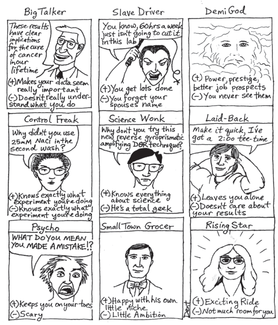
Figure 2 | The nine types of principal investigator. This cartoon was kindly provided by Alexander Dent, <u>http://dentcartoons.blogspot.com</u>.

Skills, not papers. Contrary to what you might have heard, it is not critical to have a spectacular publication record from your Ph.D. When the time comes to apply for a tenure-track job, the selection committee will focus on the productivity and promise you displayed during your postdoctoral fellowship. Furthermore, a solid Ph.D. with one good first-author paper that is based largely on your own work is all that is usually required to obtain the postdoctoral position of your dreams, particularly for citizens of